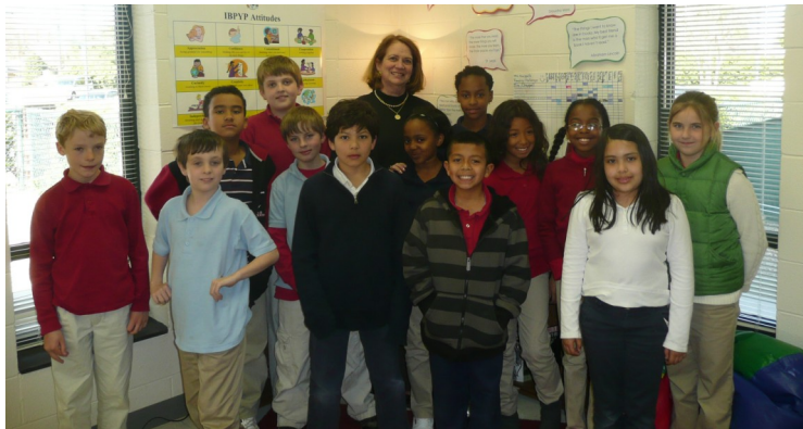
James River Elementary School's Writers Club