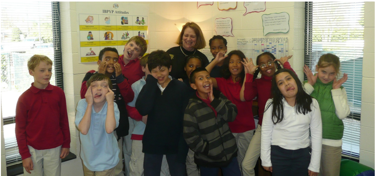
JRE Writer's Club 2011